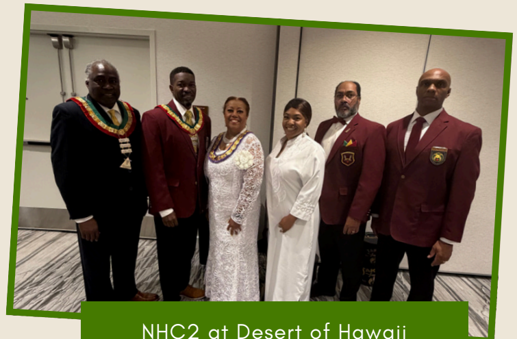
NHC2 at Desert of Hawaii Conference